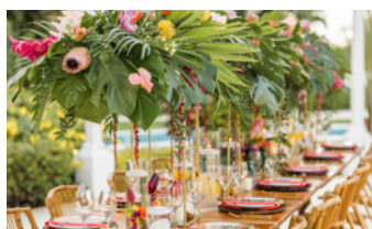
Lush in Love

We also offer 7 unique decor inspiration that can be customized to your budget and preferences for the ceremony, cocktail, and/or reception, to help create your dream wedding day. You can also mix and match the inspirations for different options; pick a ceremony look from one and the reception dinner look from the other.