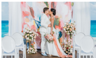
Art of Love