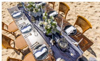
Tie the Knot-ical