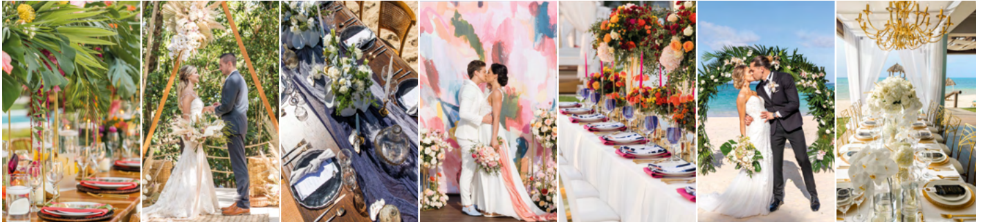
Lush in Love

We also offer 7 unique decor inspirations that can be customized to your budget and preferences for the ceremony, cocktail and/or reception, to help create your dream wedding day. You can also mix and match the inspirations for different options; pick a ceremony look from one and the reception dinner look from the other.