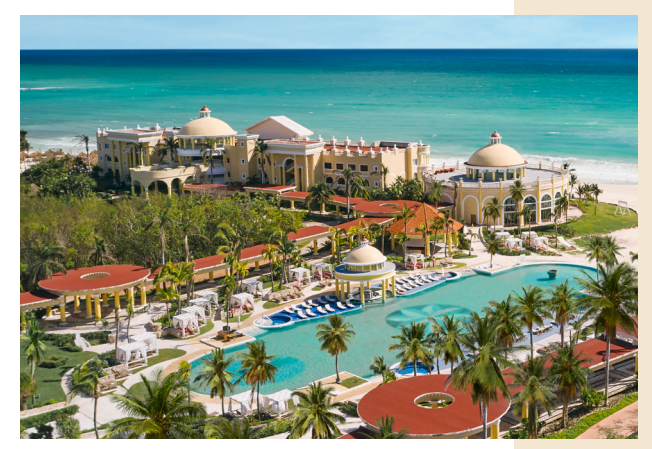
Joia Paraíso by Iberostar Mexico | Complejo Playa Paraíso