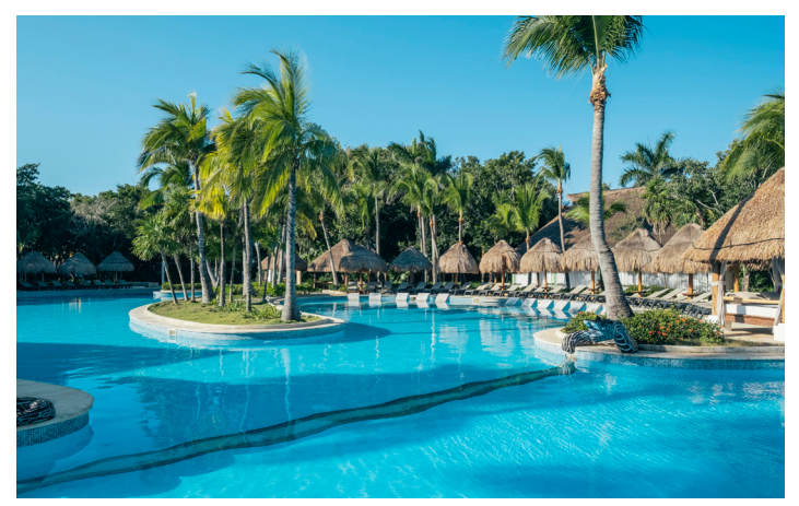
Iberostar Waves Paraíso del Mar Riviera Maya, Mexico | Complejo Playa Paraíso