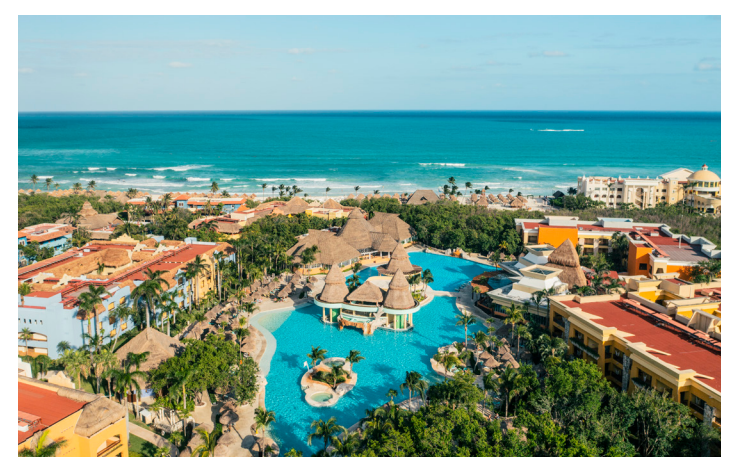
Iberostar Selection Paraíso Lindo Riviera Maya, Mexico | Complejo Playa Paraíso