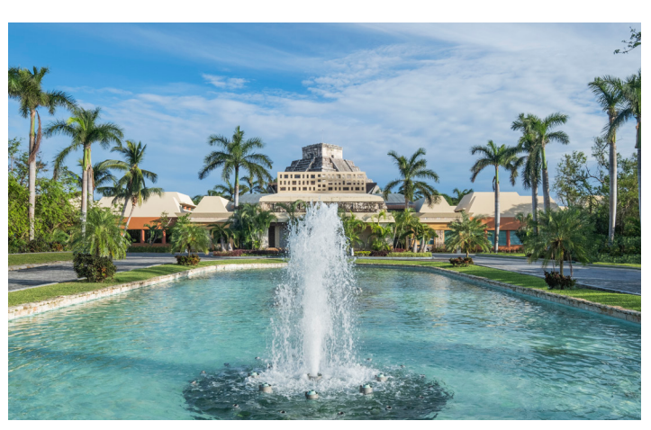
Iberostar Selection Paraíso Maya Riviera Maya, Mexico | Complejo Playa Paraíso