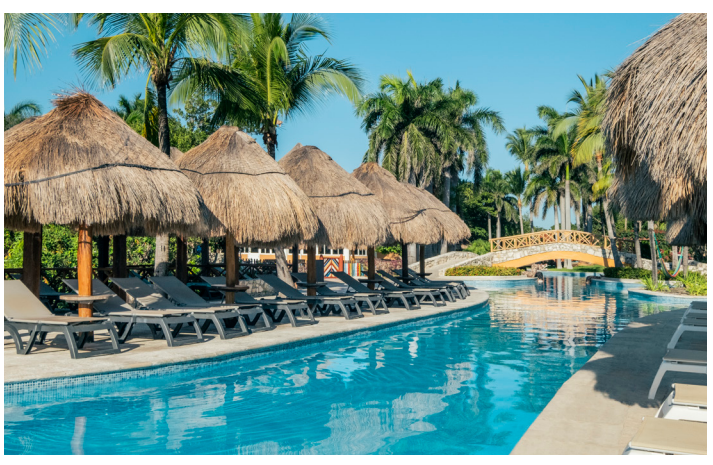
Iberostar Waves Paraíso Beach ★ ★ Riviera Maya, Mexico | Complejo Playa Paraíso