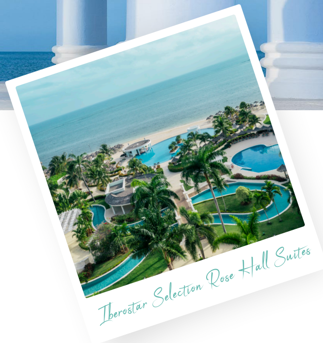
Iberostar Selection Rose Hall Suites

While you can certainly find a myriad of gastronomy, entertainment, and activity right on the resort, we encourage our guests to explore all the beauty and bounty that makes Jamaica such a stunning destination and perfect for your Jamaica wedding venue. With waterfalls, rivers, and one of the world's only bioluminescent lagoons, this island really is your oyster. And we have no doubts it will provide the perfect setting for your love story and getting married in Jamaica .