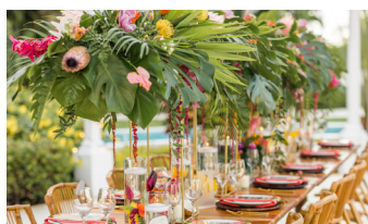
Lush in Love

We also offer 7 unique decor inspiration that can be customized to your budget and preferences for the ceremony, cocktail, and/or reception, to help create your dream wedding day. You can also mix and match the inspirations for different options; pick a ceremony look from one and the reception dinner look from the other.