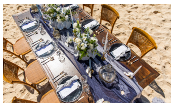
Tie the Knot-ical